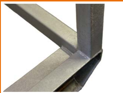
Hot Dip galvanized frame.