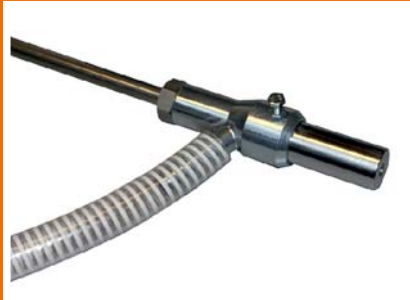
Wet Sand Blasting Equipment.