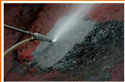
Wet Sand-blasting on Corroded steel plates.