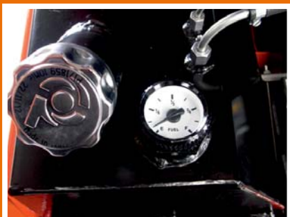
Fuel level gauge.