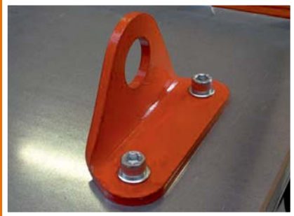
Centralized and balanced lifting eye.