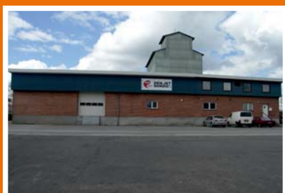
DEN-JET Factory Denmark.