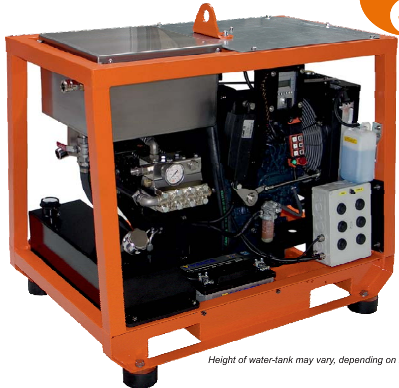
Height of water-tank may vary, depending on model